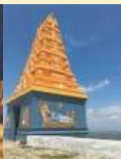
Hulugana Muradi Temple 29 km