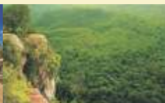
B.R. Hills 35 km