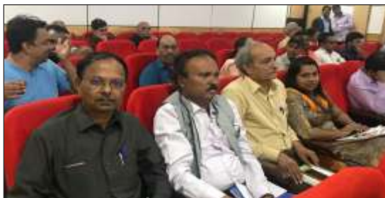
Emergency NMC Meeting at Hqrs. New Delhi