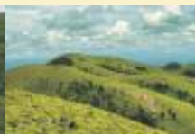
Gopalswamy Betta 45 km