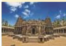
Somanathapura 40 km