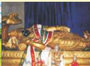
Sri Ranganatha Temple Bluff 45 km