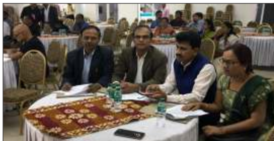
NMC Workshop at Tiruvananthapuram