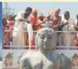
Kanaka Giri 25 km