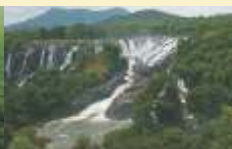
Bharachukki Falls 50 km