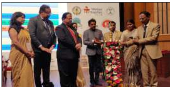
Inauguration of Family Physician Conference