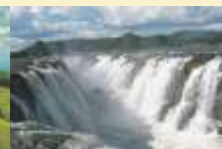
Hogenakal Falls 145 km