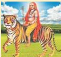
Sri Male Mahadeshwara Hills 120 km