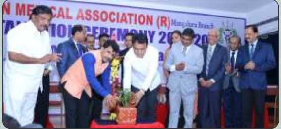
Installation Ceremony of IMA Mangalore Branch